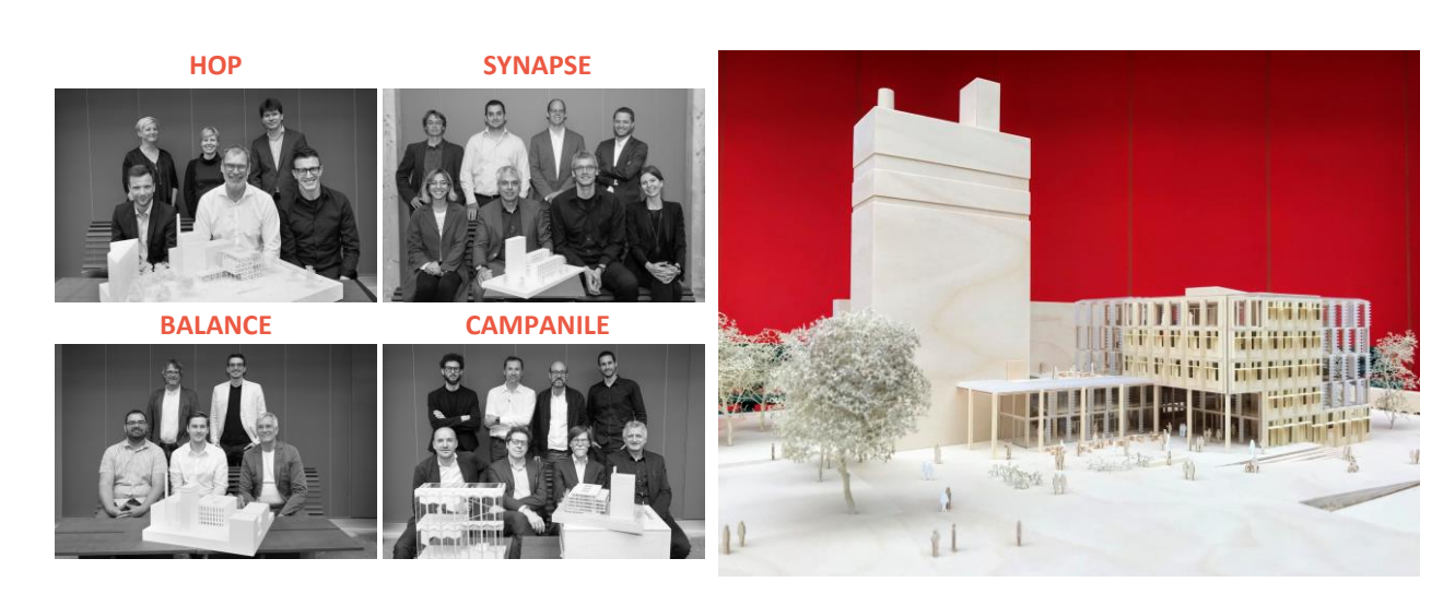
Figure 2. Participating teams [3,4,5,6] forming part of the parallel studies mandate (left); model of the HOP winning project (right).

The parallel studies mandate process included open dialogues where interactions between all participants (candidates, expert panels, users and Smart Living Lab researchers/specialists) enabled candidates to share approaches, ideas and solutions and allowed for projects to be developed over the course of the process. A panel of experts was tasked with assessing the proposals made by the multidisciplinary groups. This panel mainly consisted of external and independent experts, architects, engineers and specialists in the area of buildings, as well as representatives of BFF SA, the State of Fribourg and academic institutions partnered with the Smart Living Lab. [2].